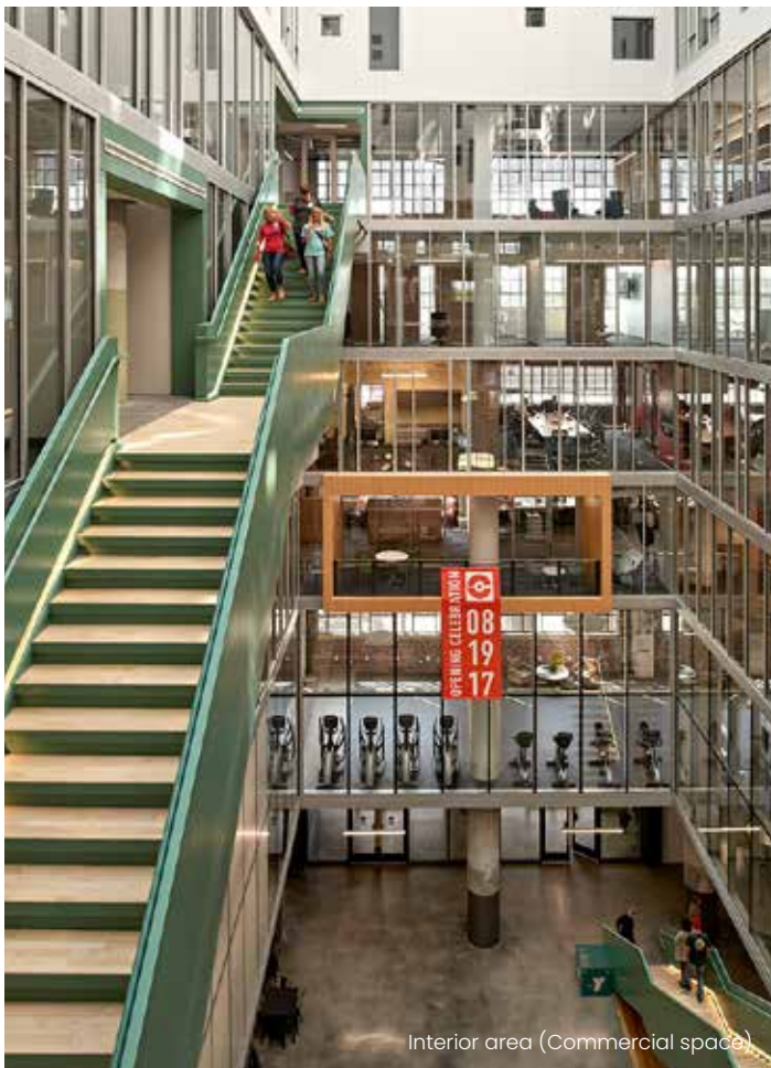
Interior area (Commercial space)

Many of the original 1920s relics of the warehouse were reclaimed and reused as interesting and functional design elements. The floors are the original concrete rustic, industrial, yet polished to be functional without losing any character.