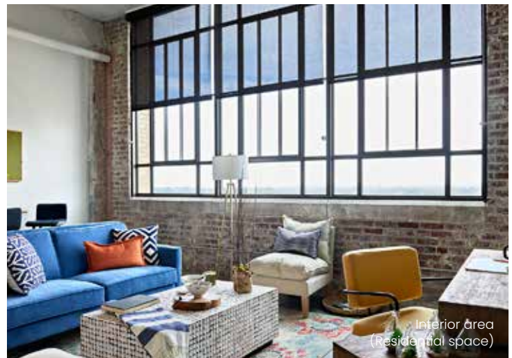
Interior area (Residential space)